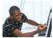
Summer College at Caldwell