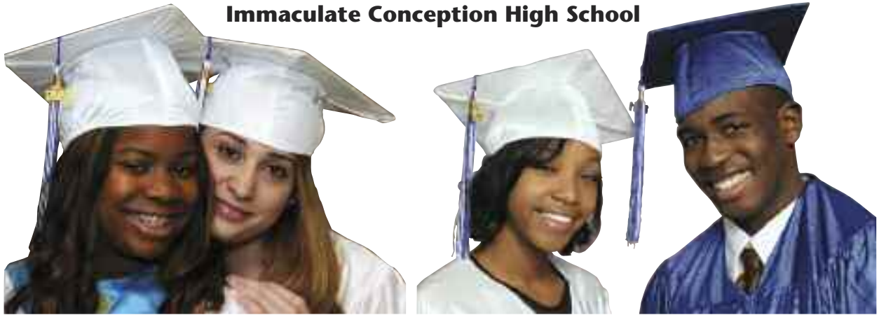
ICHS 82nd Graduation