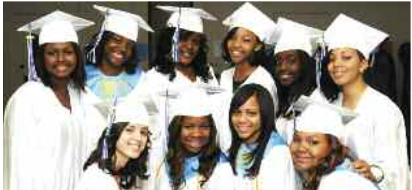
Class of 2011