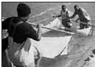
Sandy Hook Students sift through the inlet waters to net living specimens, to examine and return to the water.

When the rest of my class and I got off the bus on our trip to Sandy Hook and reached the boardwalk, we could already smell the scent of the beach. As it so happens, I have a fear of going in the water, but the smell of the beach, which I love, immediately calmed me.